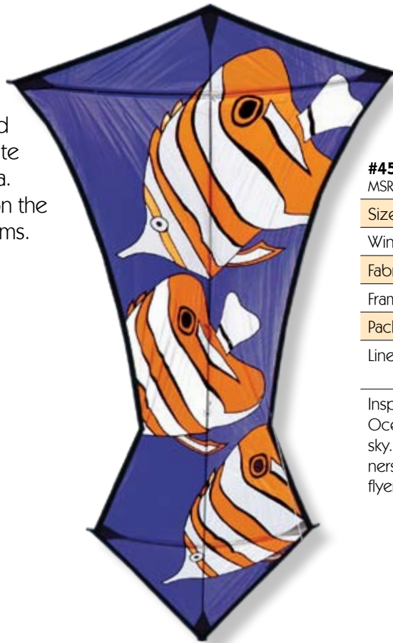
#45814 MOREA MSRP $129.95