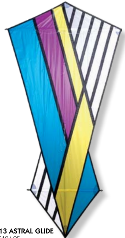
#45813 ASTRAL GLIDE MSRP $104.95

The Bonnaire Pocket Rocket is a small but efficient flier with the great graphics that have become a signature of Ron's designs. Add this to the many sea creatures that Premier offers to help build your own sky aquarium!